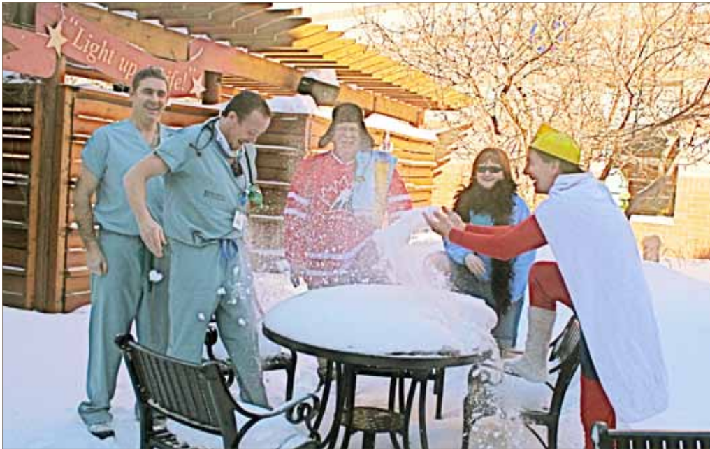
Dippers in Training!

Once again Gilda Radner’s famous line comes to mind - “It’s always something!”